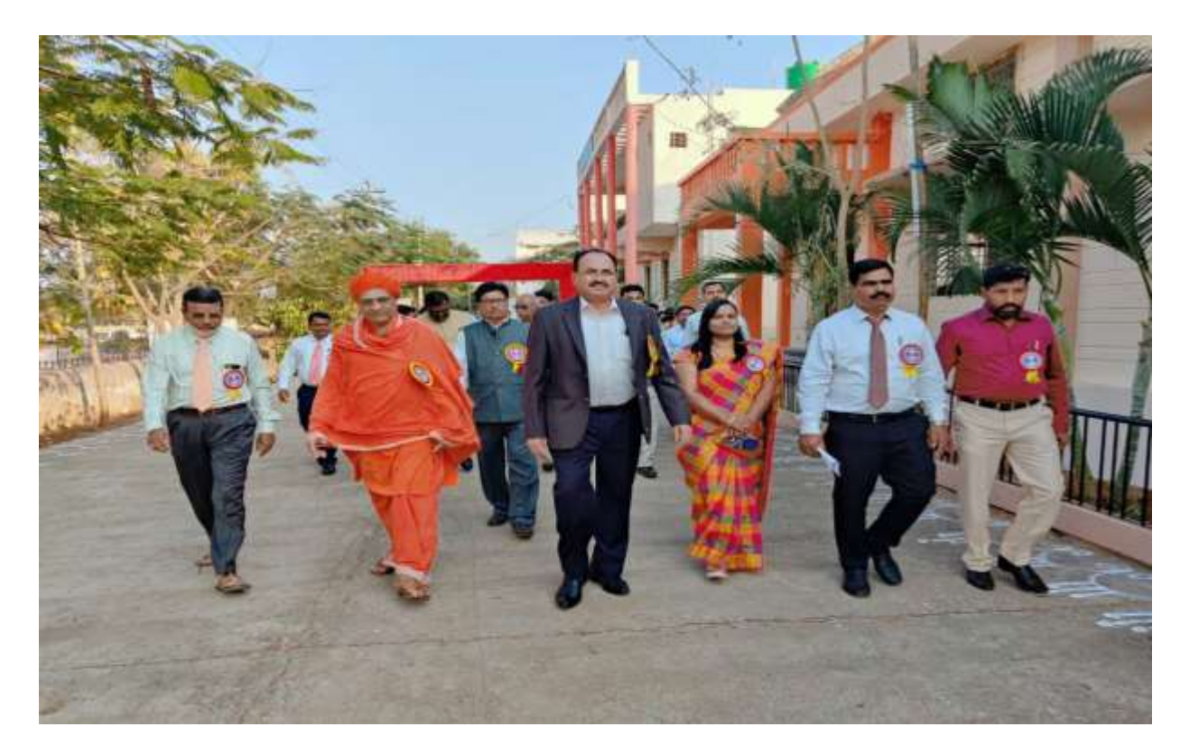
4. C. G. Suttatti Auditorium Hall, STC College, Banhatti.